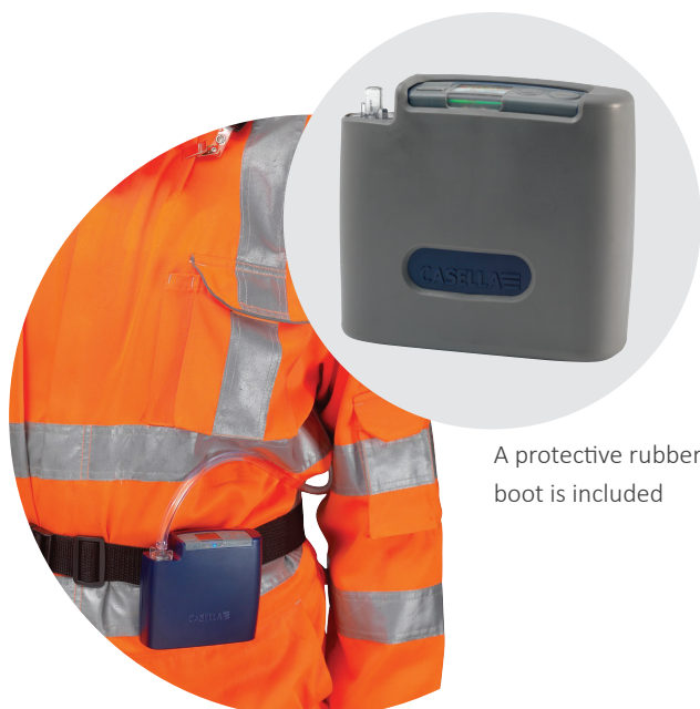
A protective rubber boot is included