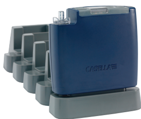
Apex2 pump with 5 way charger