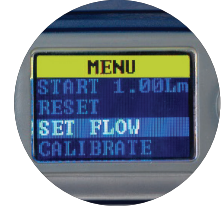
Easy to use menu