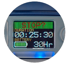
Colour coded display showing remaining battery life