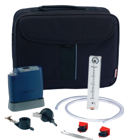
Starter Kit available to include sampling accessories