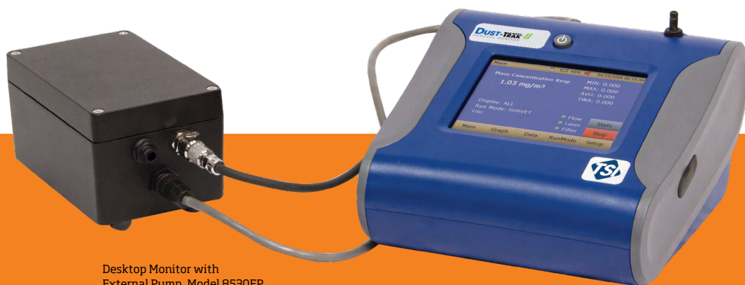
Desktop Monitor with External Pump, Model 8530EP