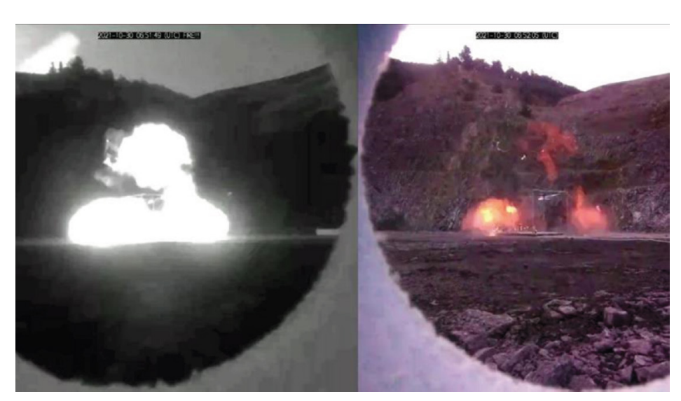
Image of the same hydrogen explosion taken from a near-infrared and a color video