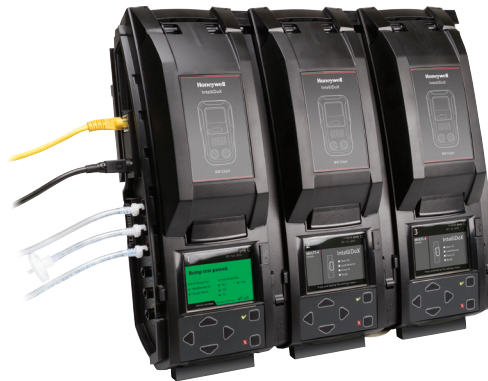
IntelliDoX automated instrument management system