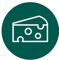
Food Manufacturing & Packaging