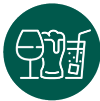
Breweries & Wineries