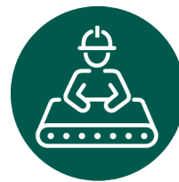
Manufacturing, Welding & Metal Fabrication