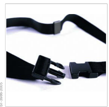
Dräger Saver Waistbelt