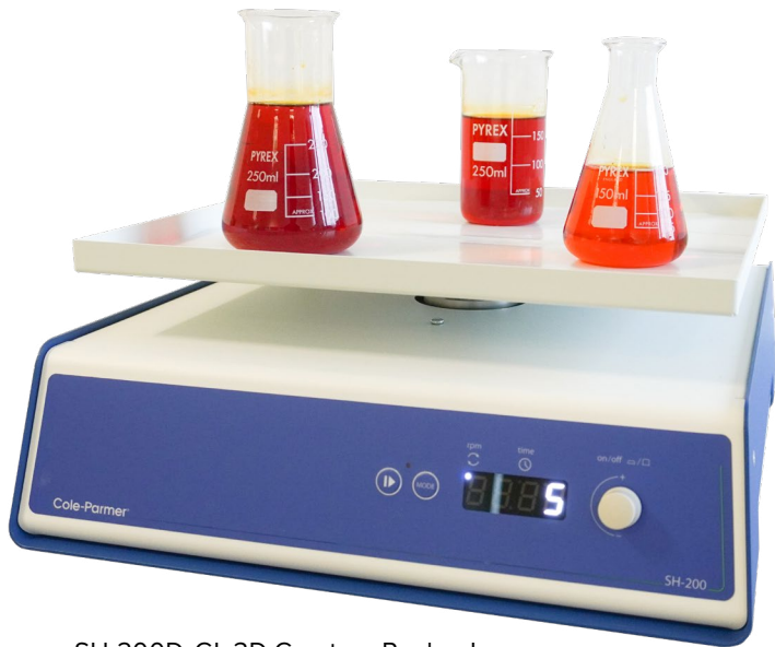
SH-200D-GL 3D Gyrotory Rocker Large