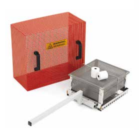
Sample basket set, with loading handle attached, spare paper printer rolls and (red) sample basket cooling cover