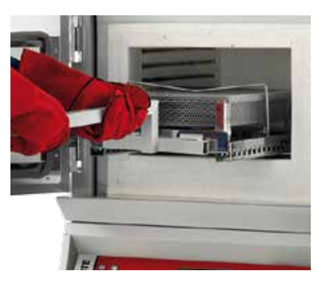
Loading sample basket

For operator safety the ABA 7/35B's door remains locked until the test is completed. The end point is automatically detected by the ABA 7/35B using absolute or percentage weight changes, whichever is required by the standard method used. The test endpoint is signalled by an audible alarm and the results are automatically printed.