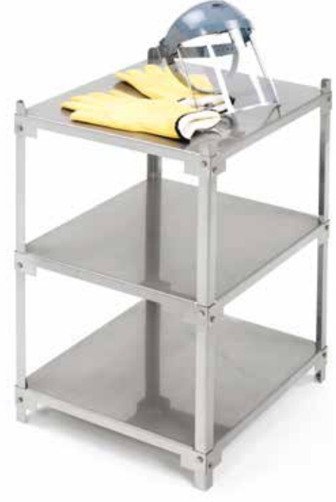
3 level sample basket cooling stand, gloves and face shield