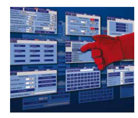
Easy to use LCD touchscreen to set up recipes