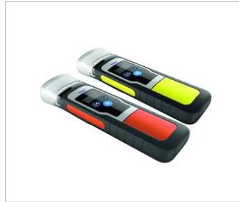
Optional reflector film set (yellow or orange)