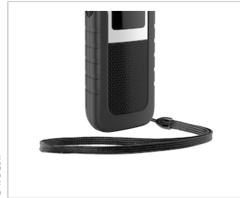
Grips and wrist-straps for secure holding