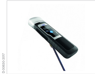
1/4" thread for mounting a selfie stick