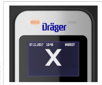
"Alcohol Detected" symbol