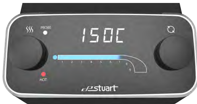
Hotplate Stirrer digital interface

With constant digital temperature display