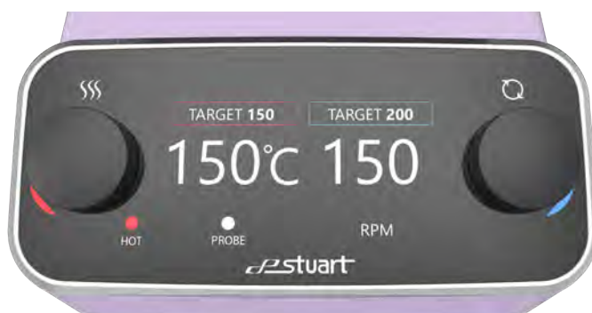
Hotplate Stirrer premium interface

With TFT display for temperature and stirring