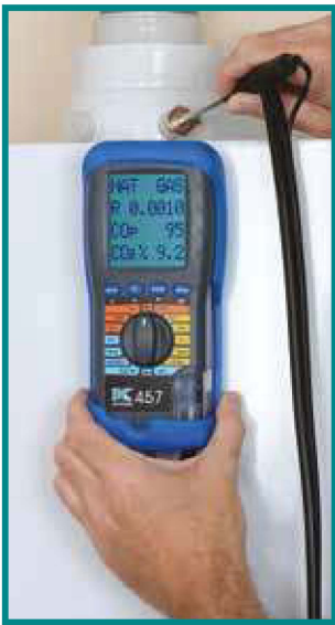
Flue Gas Analysis