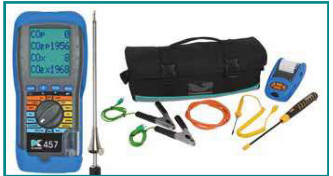
KANE457 PRO KIT