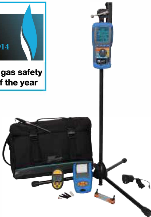
KANE457 CMDDA1 KIT