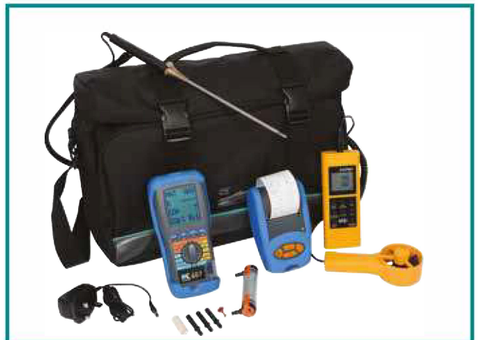
KANE457 COM-CAT KIT

Optional wireless module compatible with: