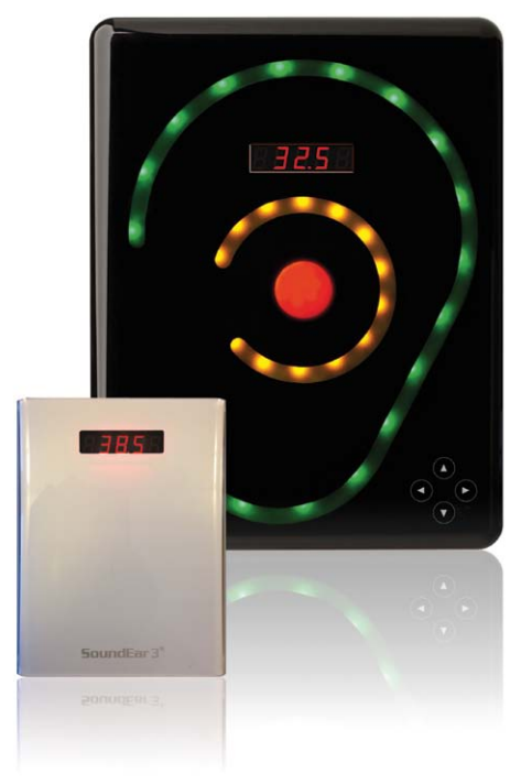
SoundEar®3 is available in two versions.

Not only does a good auditive environment facilitate recovery, it also leads to better sleep patterns and higher levels of patient and staff well being.