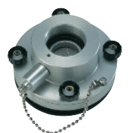
Duct mount flange