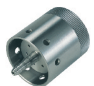
Weather protection cap