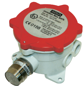
47K 3/4" NPT

Additional accessories are available for environmental protection and a remote/in-situ calibration kit for ease of maintenance.