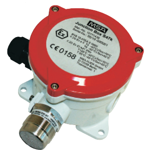
47K M25 x 1.5