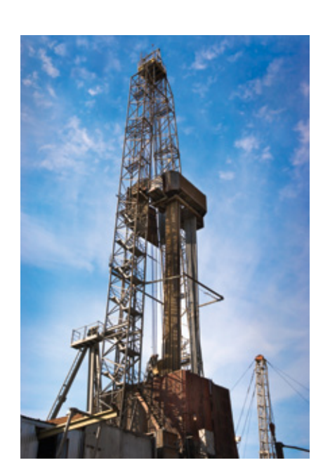
MeshGuard wireless gas detectors are designed for use in the harshest outdoor environments such as drilling rigs and in other industrial applications