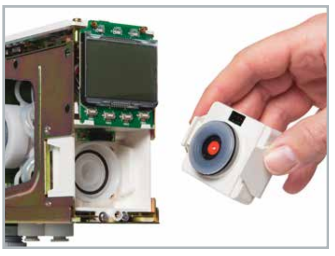
Midas Gas Detector plug-and-play sensor cartridge allows quick and easy sensor replacement