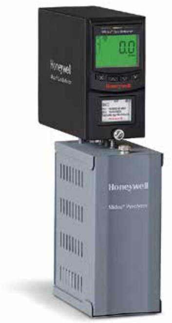
Midas Gas Detector with Midas Pyrolyzer

Offered as an option, the Midas Pyrolyzer allows for the detection of NF _3 and other CFX gases. Cost of ownership is low, as the Pyrolyzer has a replaceable heater assembly with a lifespan of greater than two years. Even more, thanks to our new proprietary catalyst to improve efficiency in gas conversion, the Pyrolyzer delivers automatic flow control, temperature control, and fast and accurate performance. Additionally, the Pyrolyzer can run from a Midas Gas Detector that's powered by either PoE or 24 VDC.